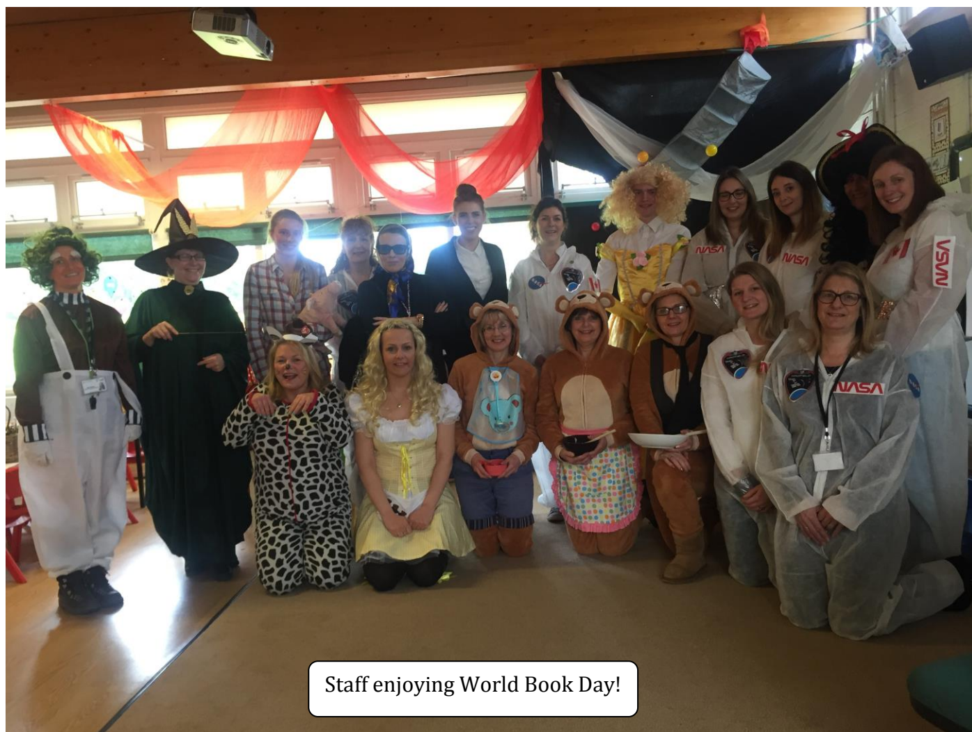
Staff enjoying World Book Day!