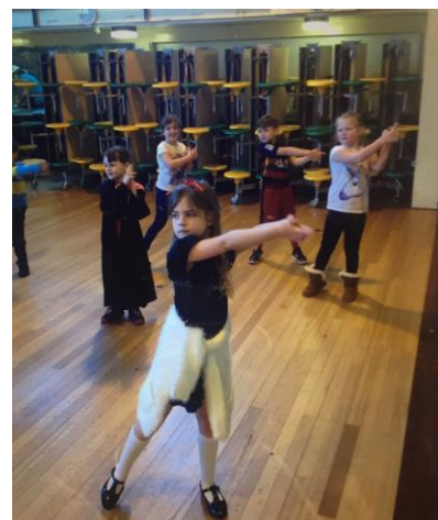
Year 2 Dance based on The Darkest Dark