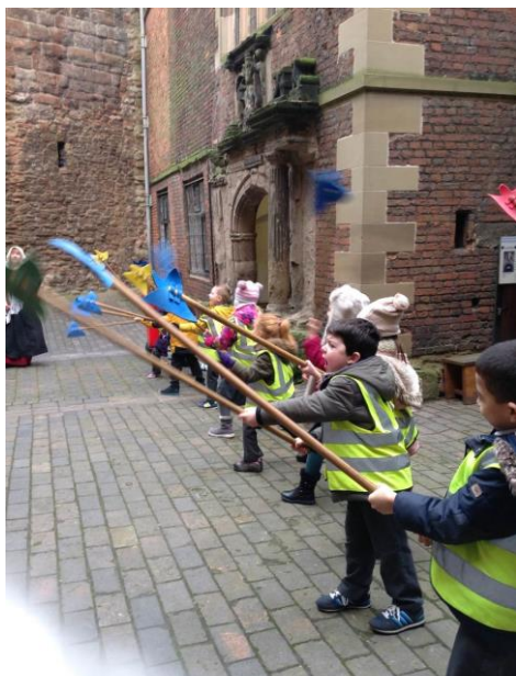
Year 1 Visit to Tamworth Castle this week!